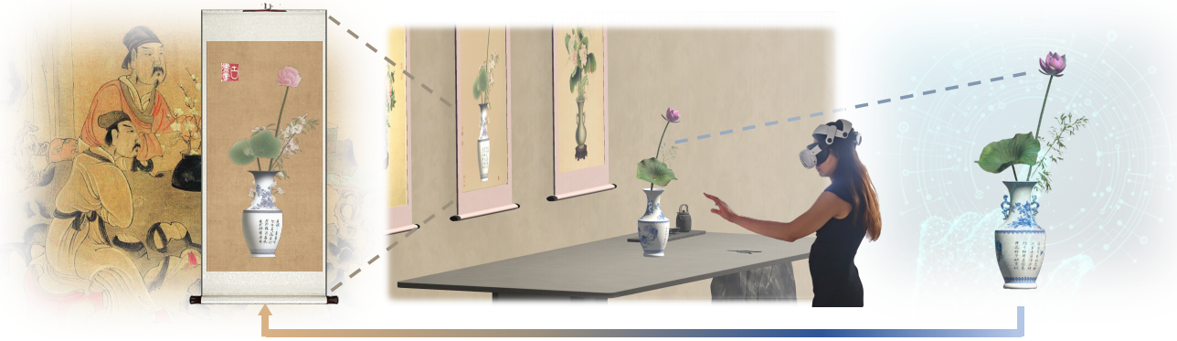
Figure 1: Timeless Blossoms, a VR-AI system where users craft 3D floral designs that generative AI transforms into real-time Xieyi paintings, merging traditional art with technology for cross-cultural and temporal dialogue.

The Hong Kong University of Science and Technology (Guangzhou) Guangzhou, China The Hong Kong University of Science and Technology Hong Kong SAR, China mingmingfan@ust.hk